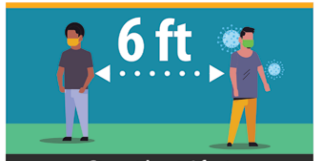
Stay at least 6 feet (about 2 arms' length) from other people.